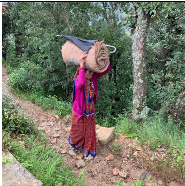
Women are the cornerstone of the hillside agroecology