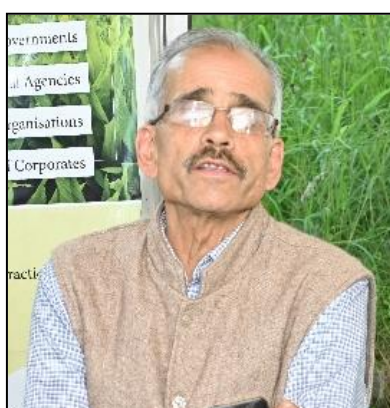
Shri Vinod Pande