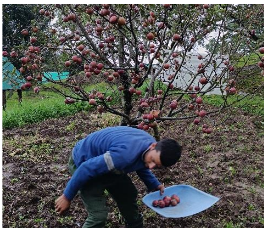
Organic apple orchard at Sari village