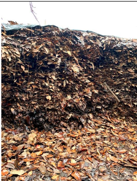
Collection of oak leaves for the Agro-ecosystem economy