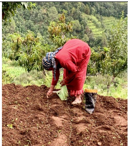
A villager is planting seeds in the agricultural field