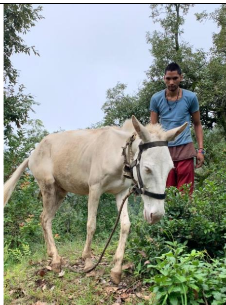
Local transportation currently has a minimal carbon footprint