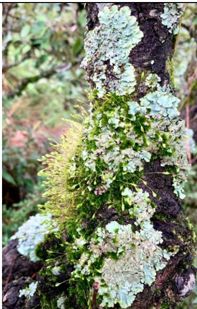
Lichen and mosses play a vital role in conserving water