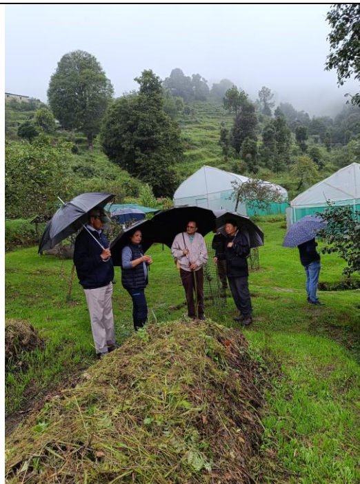
Organic compost at the Sarg Training Centre